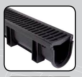
CHANNEL & GRATE 130 (Available in 1 & 3 metre lengths) 1m 1SDCGB130 3m 1SDCGB130.3