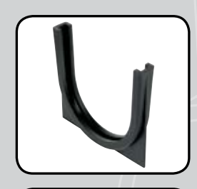
FEMALE JOINER (For connecting two male ends) 1SDFFSPB