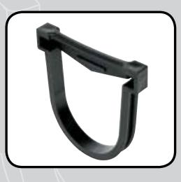
MALE JOINER (For connecting two female ends) 1SDMMSPB